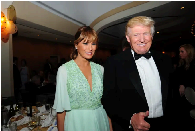
Networks running scared of Trump at the White House Correspondents' Association dinner