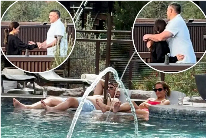
New England Patriots' Mike Vrabel and top NY Times NFL reporter Dianna Russini hold hands and hug at luxury hotel