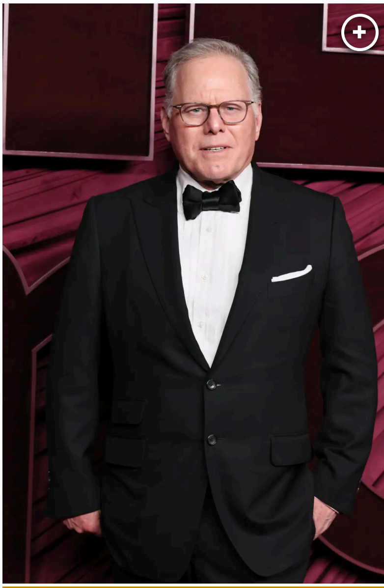
Zaslav hung up on the disgraced hip-hop mogul.

“As you know, I’m suing Warner Bros,” Simmons told Zaslav during the brief call, suggesting they should be able to sort out the matter between them. “And you can fix this whole thing. Let’s do this,” he said. Zaslav’s response was curt and to the point: “I can’t get involved in this.” He then hung up.